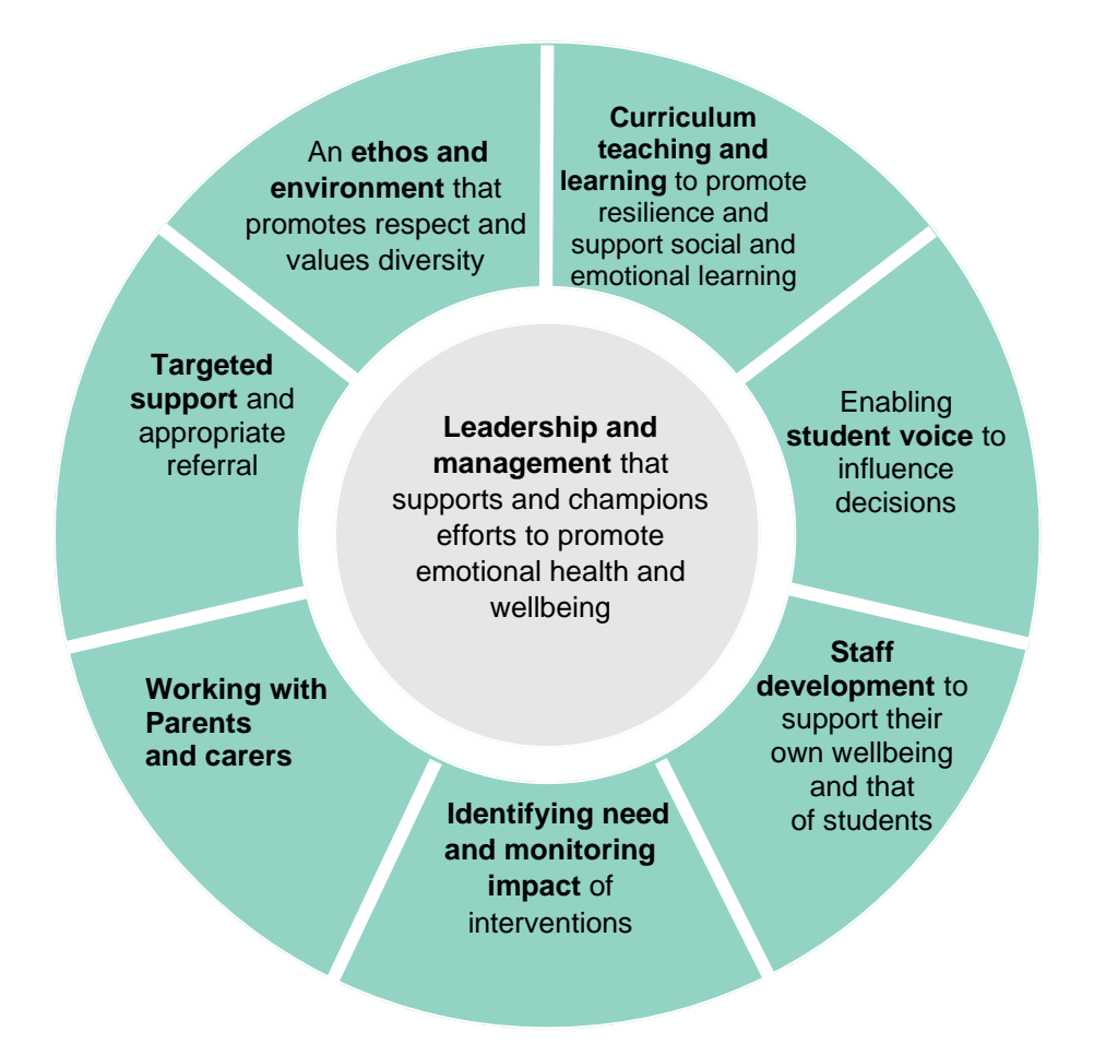
Figure 2. Text alternative

The 8 principles to promoting a whole school and college approach to mental health and wellbeing is presented in a wheel diagram with 'leadership and management that support and champions efforts to promote emotional health and wellbeing' at the centre. Radially surrounding this core principle are the 7 other principles below, arranged in a clockwise manner: